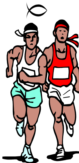
Team members race to the finish line .....Christ's amazing love.

Please hold these brothers and sisters in Christ in prayer as they prepare to share Christ's love with our guests.